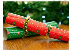
These ones !

It is also important if you need to show that you are old enough to visit some places, or whether you need to pay a child price or a grown up price to get in somewhere.