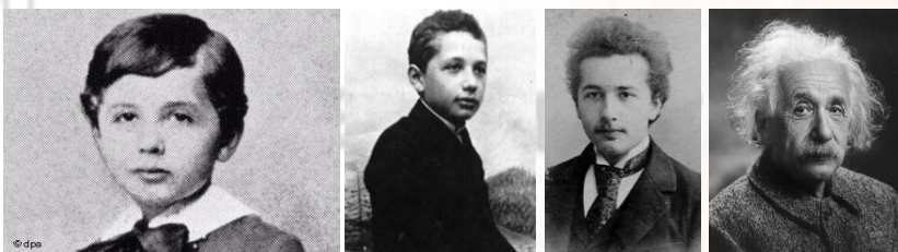
Photos of the genius Albert Einstein getting older