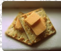
Not those ones !