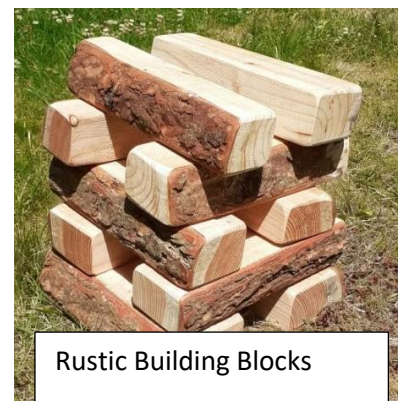
Rustic Building Blocks