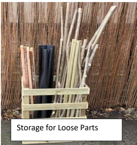
Storage for Loose Parts