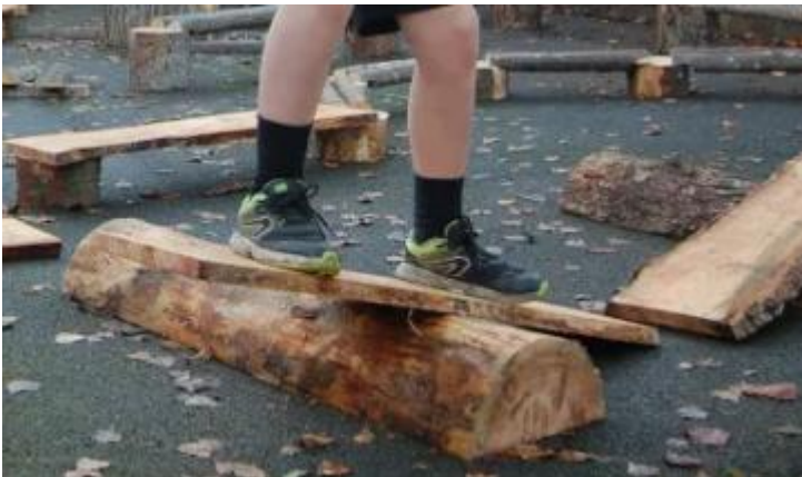
Giant Balance Boards

Are there any parents/grandparents who would be able to supply us with the following 'rustic' apparatus for our meadow area?