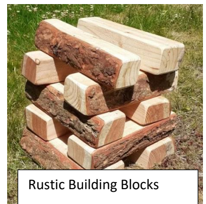
Rustic Building Blocks