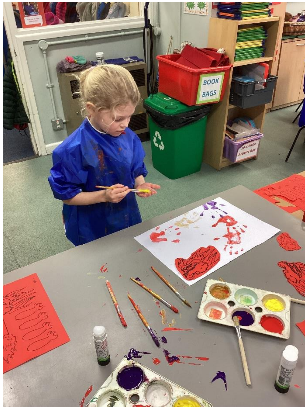
Chinese New Year in Class 1