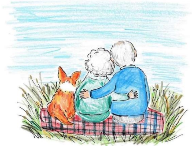
Hello again Lilibet ♥