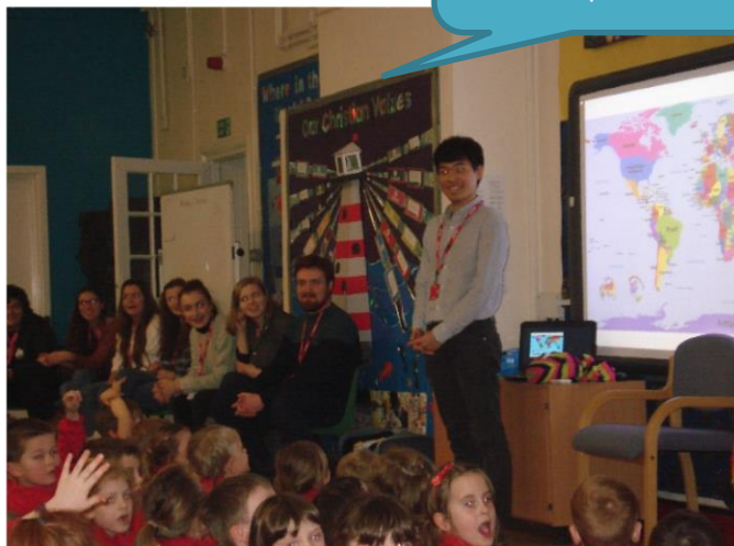
Visitors from around the world in Worship Time ...