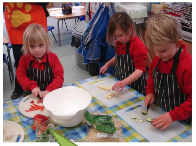
Cooking in Class 1 ...