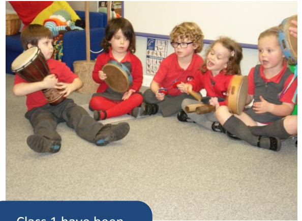
Class 1 have been using the musical instruments!